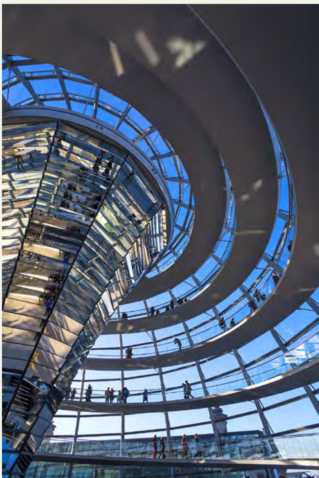
Below: Berlin's Reichstag building is topped by Sir Norman Foster's modern dome