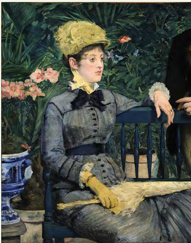
Above: a detail of Edouard Manet's In the Conservatory , 1879, housed at the Alte Nationalgalerie, Berlin