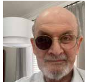
Clockwise from top left: Anthony Albanese, Shirley Hazzard, Salman Rushdie and Volodymyr Zelensky.